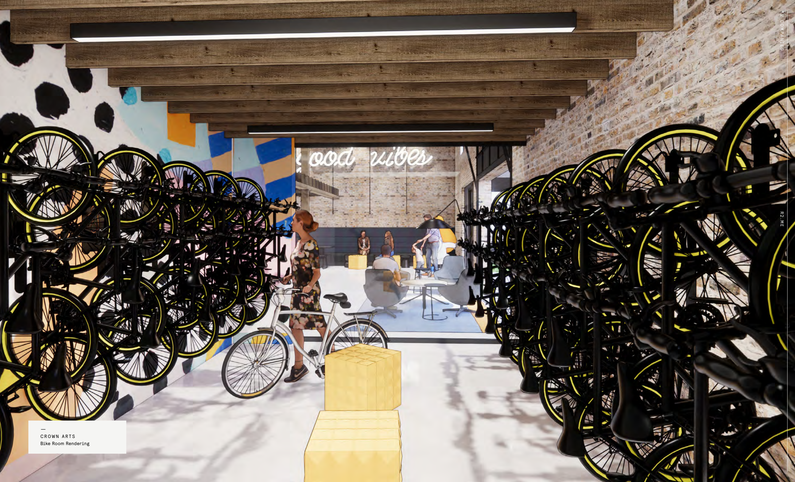
CROWN ARTS Bike Room Rendering