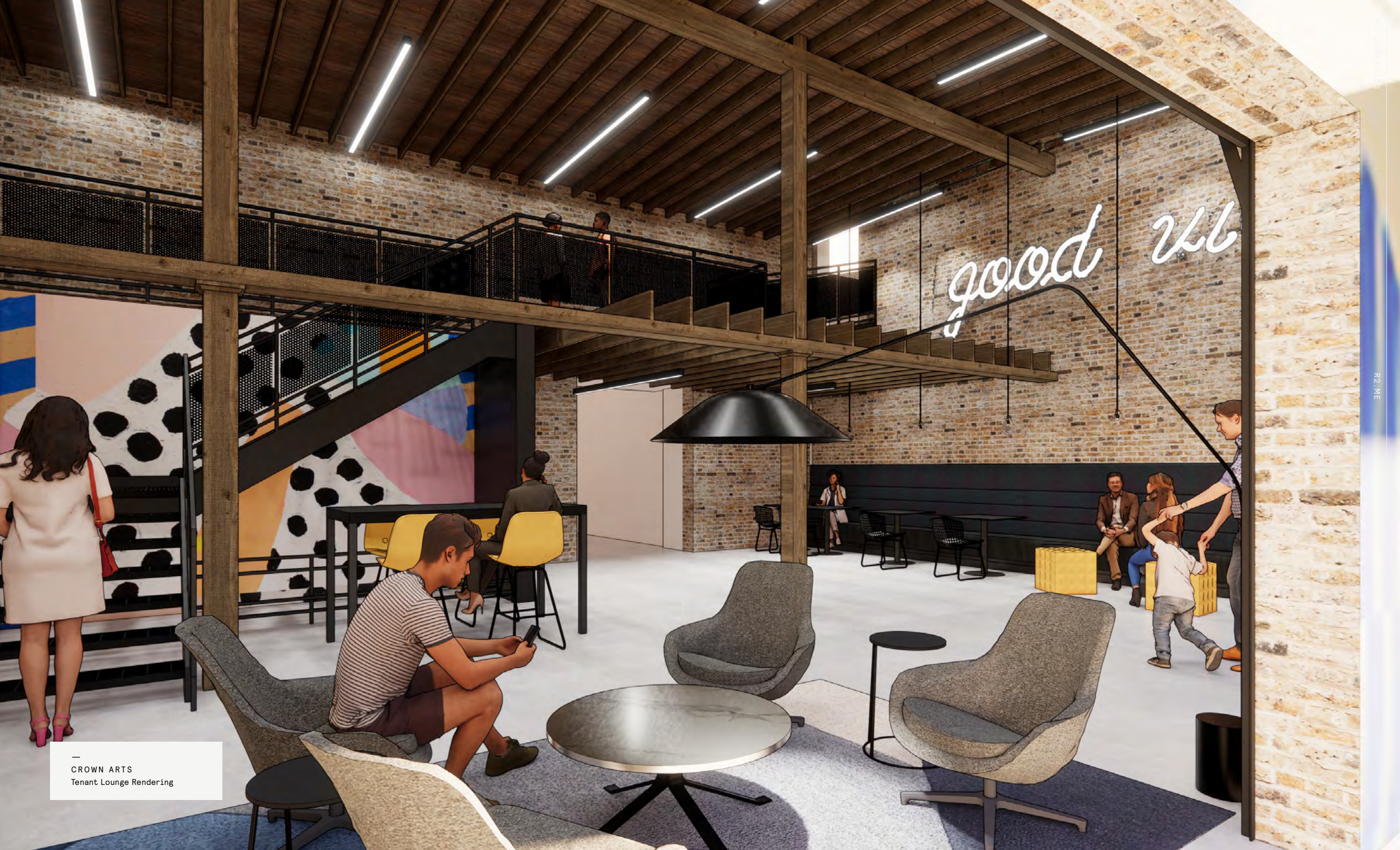
CROWN ARTS Tenant Lounge Rendering