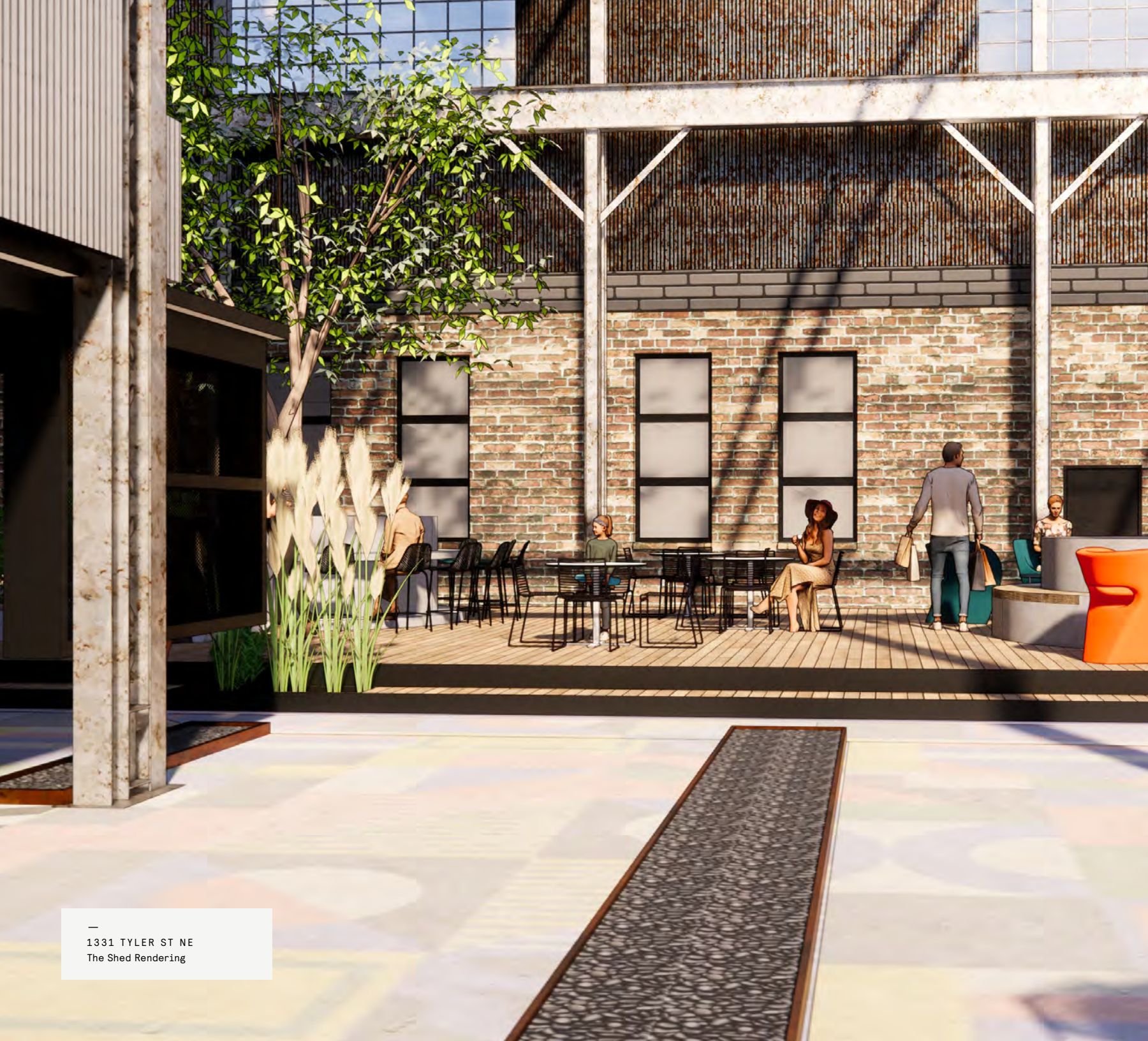
1331 TYLER ST NE The Shed Rendering