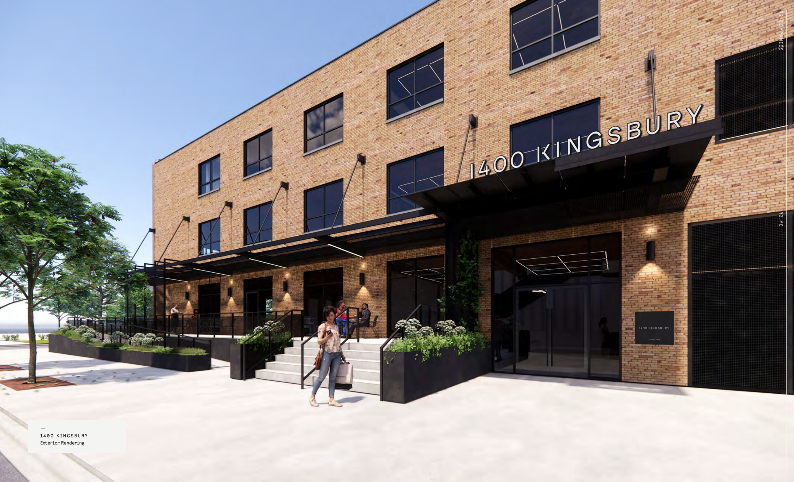
1400 KINGSBURY Exterior Rendering