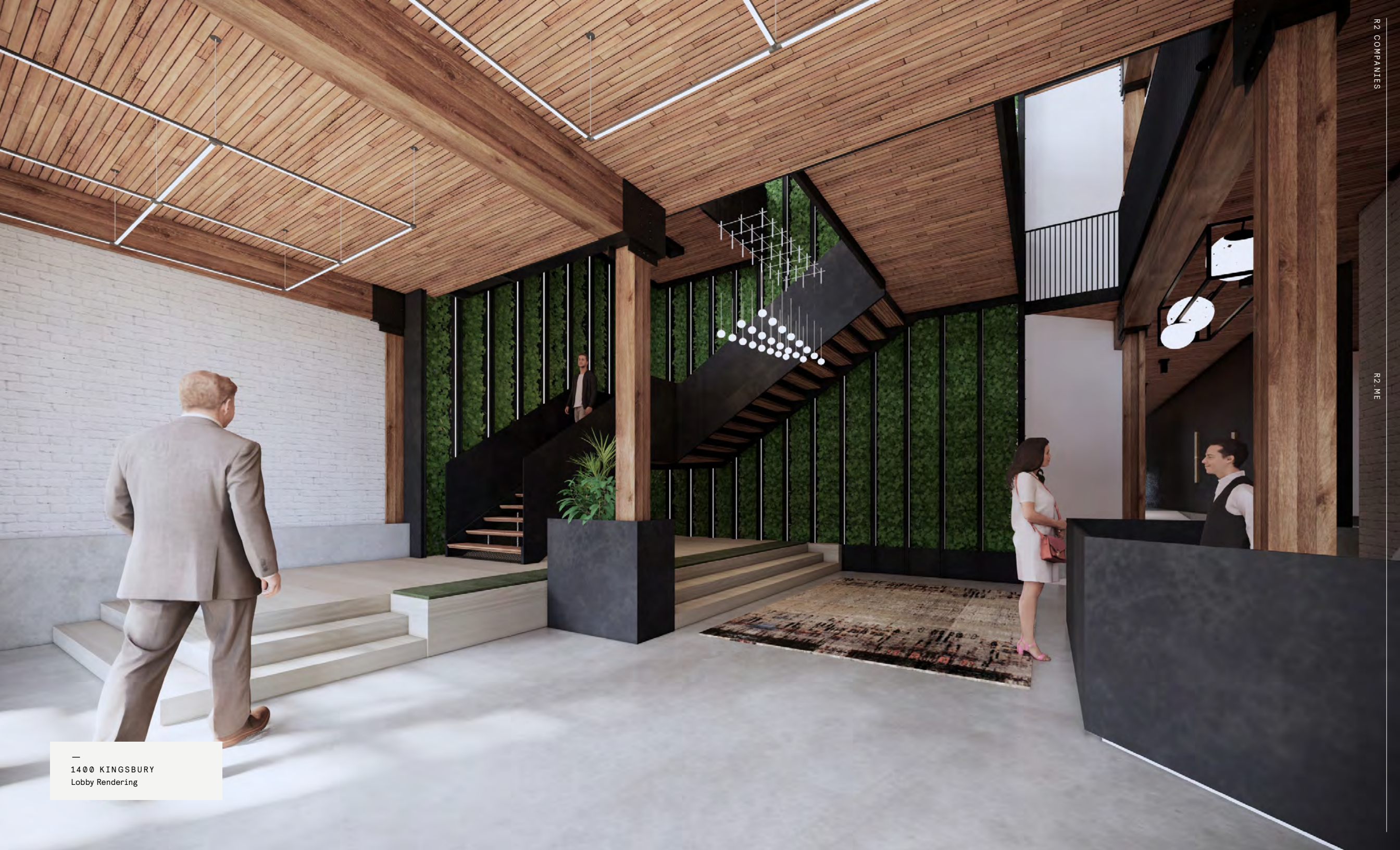
1400 KINGSBURY Lobby Rendering