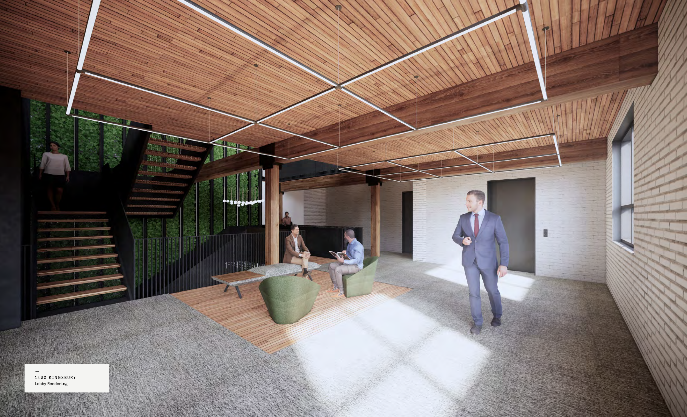
— 1400 KINGSBURY Lobby Rendering