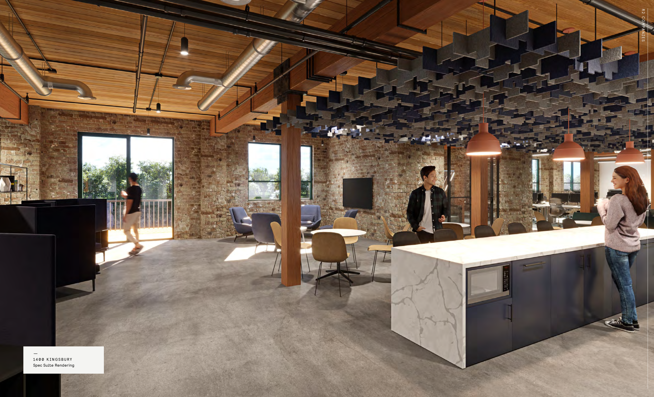
1400 KINGSBURY Spec Suite Rendering