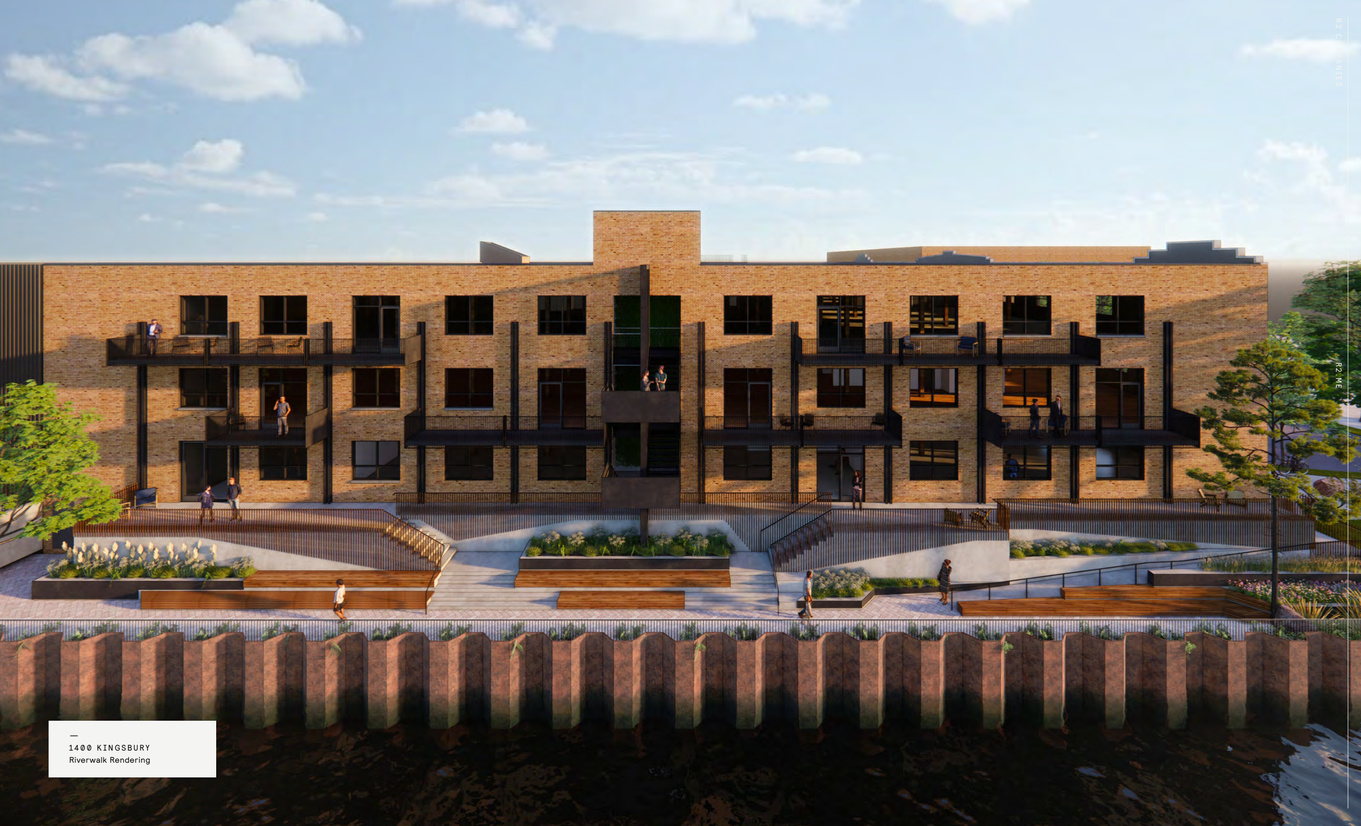
1400 KINGSBURY Riverwalk Rendering