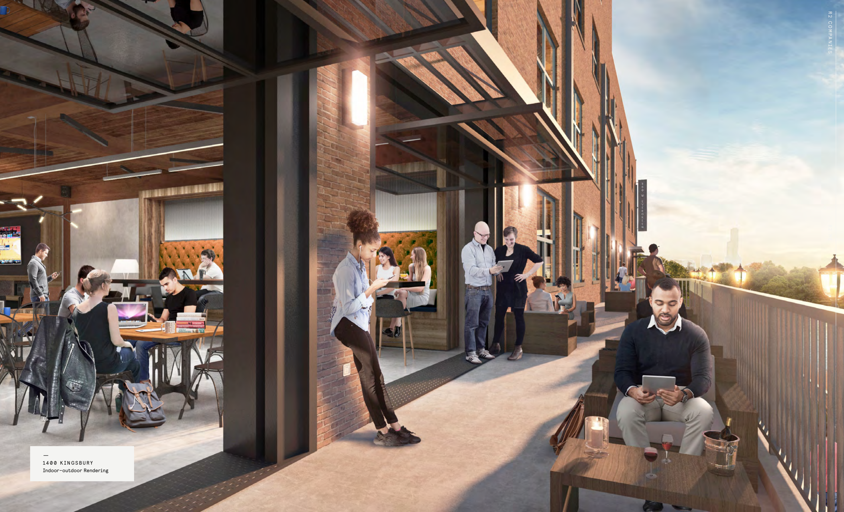
— 1400 KINGSBURY Indoor-outdoor Rendering