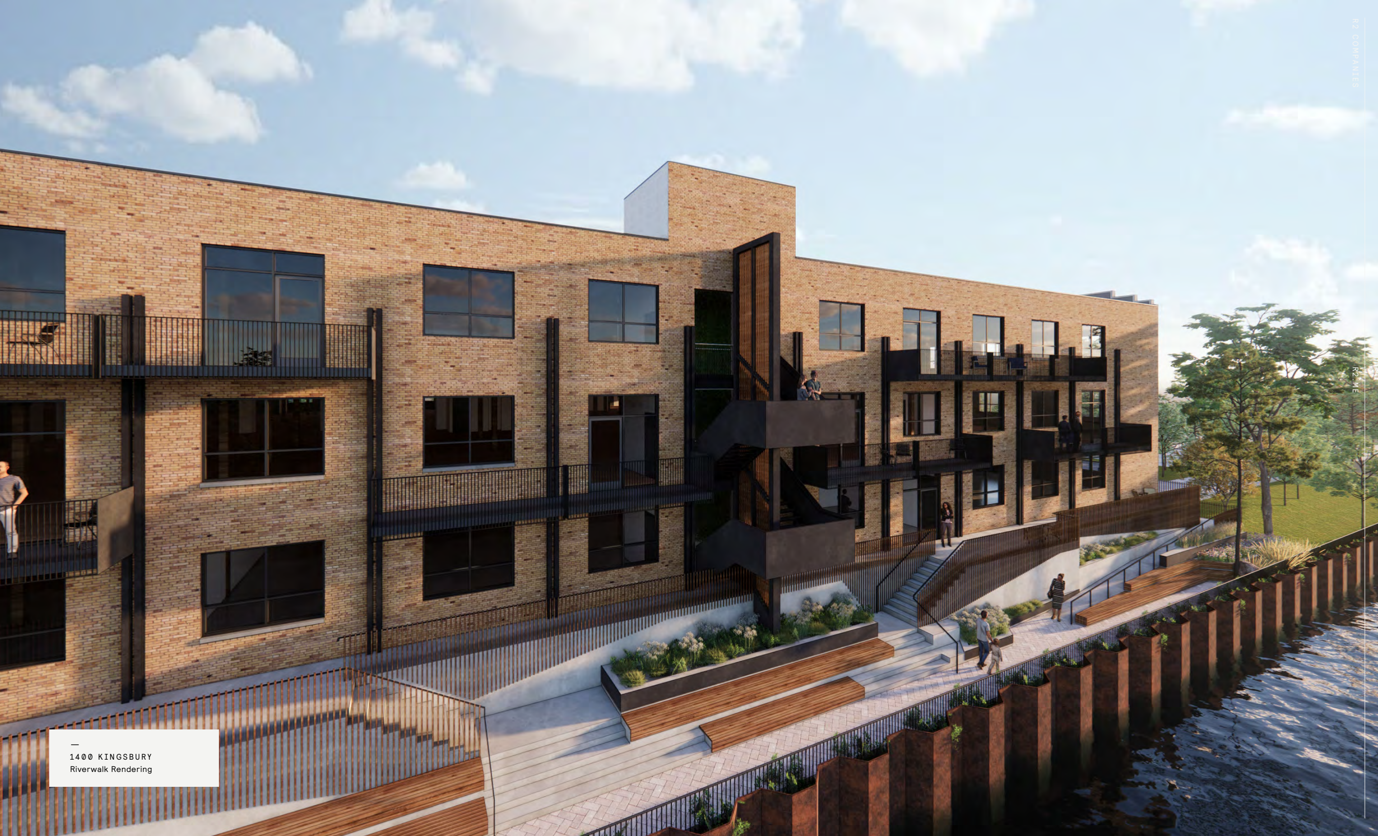
— 1400 KINGSBURY Riverwalk Rendering