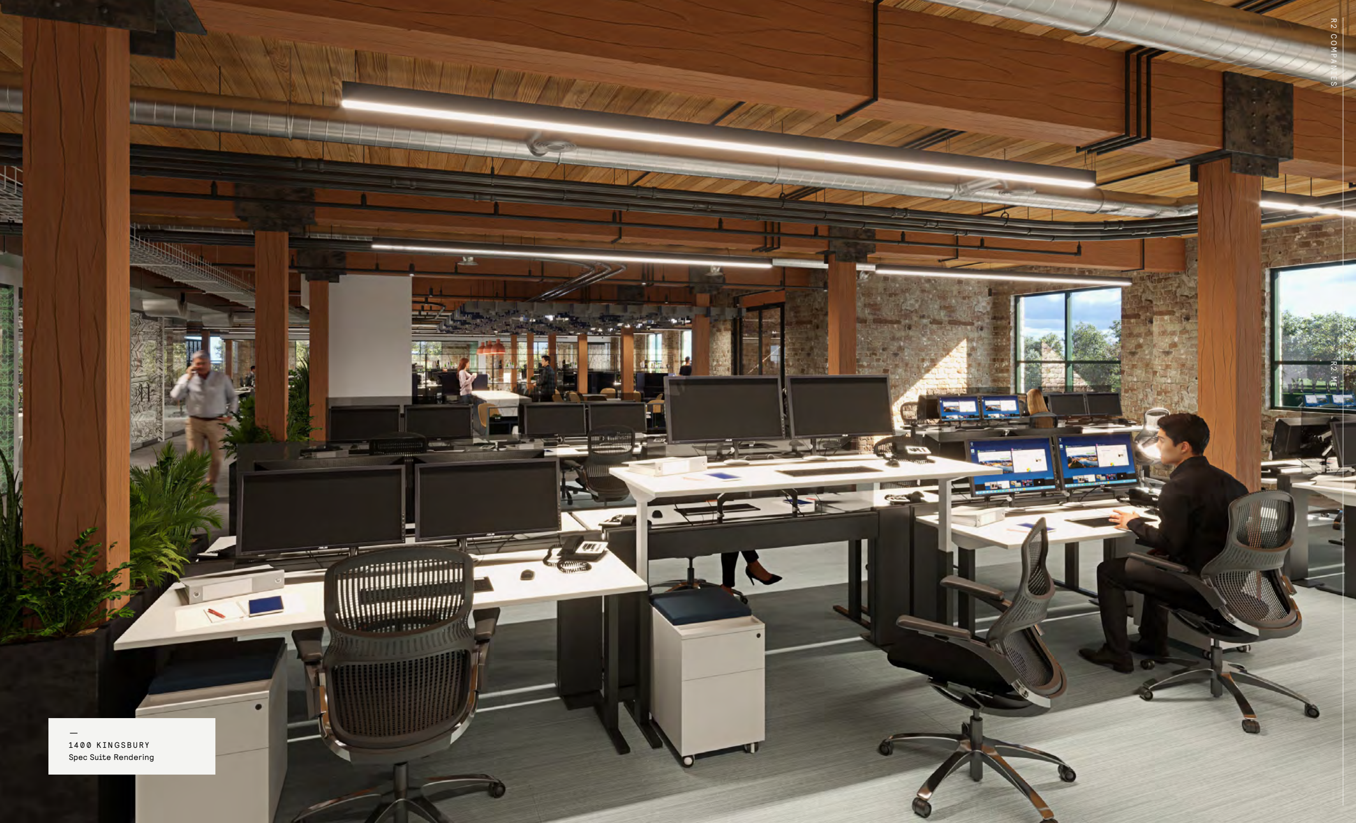
1400 KINGSBURY Spec Suite Rendering