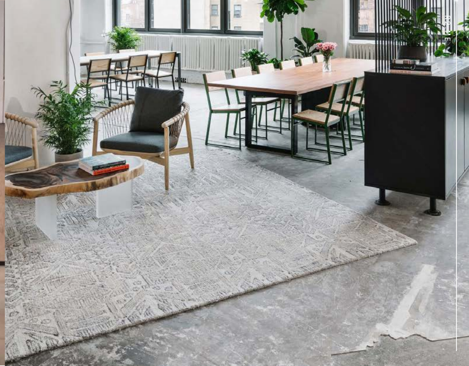
— INTERIOR PRECEDENTS The Atlas Building