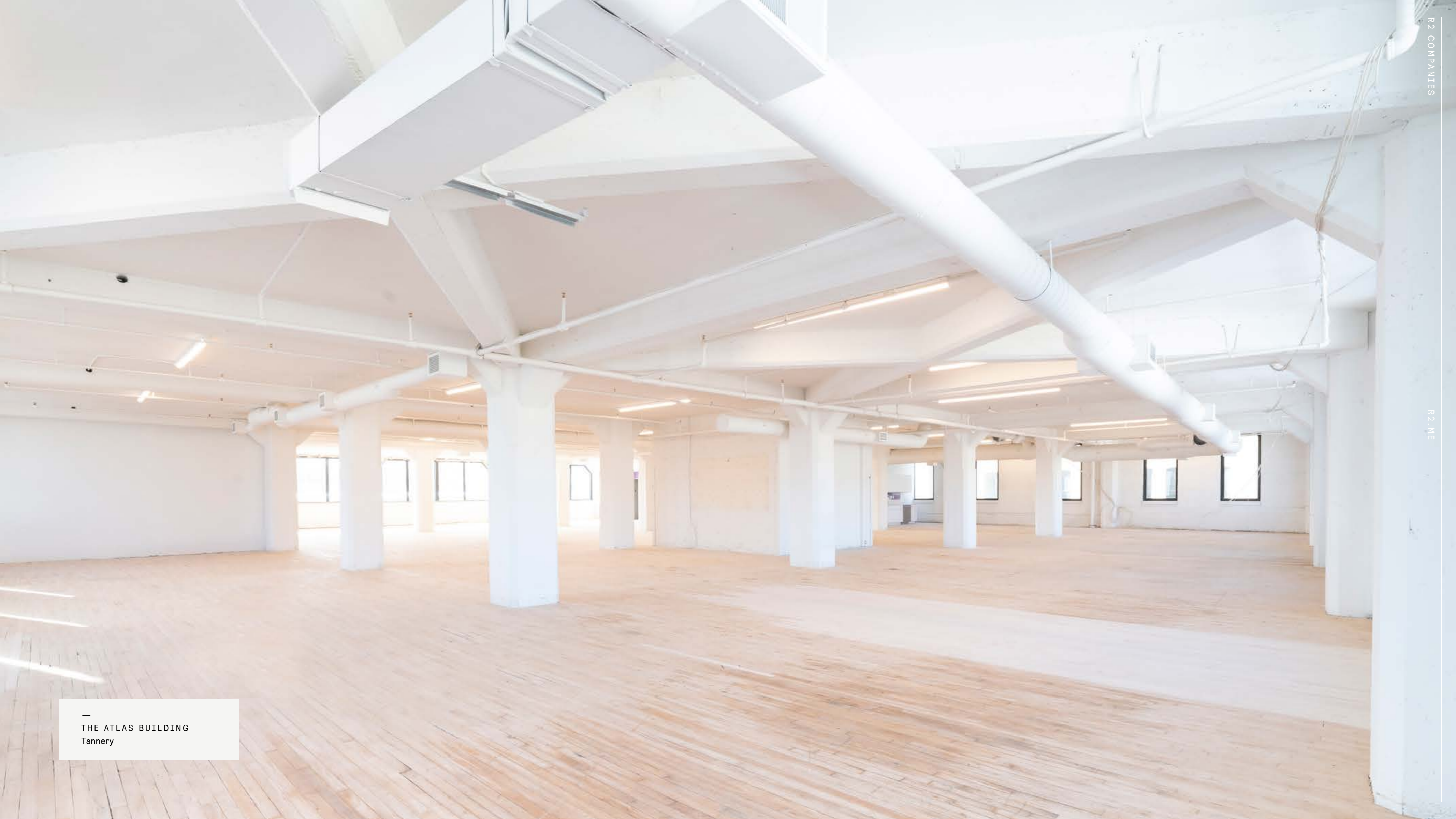
— THE ATLAS BUILDING Tannery