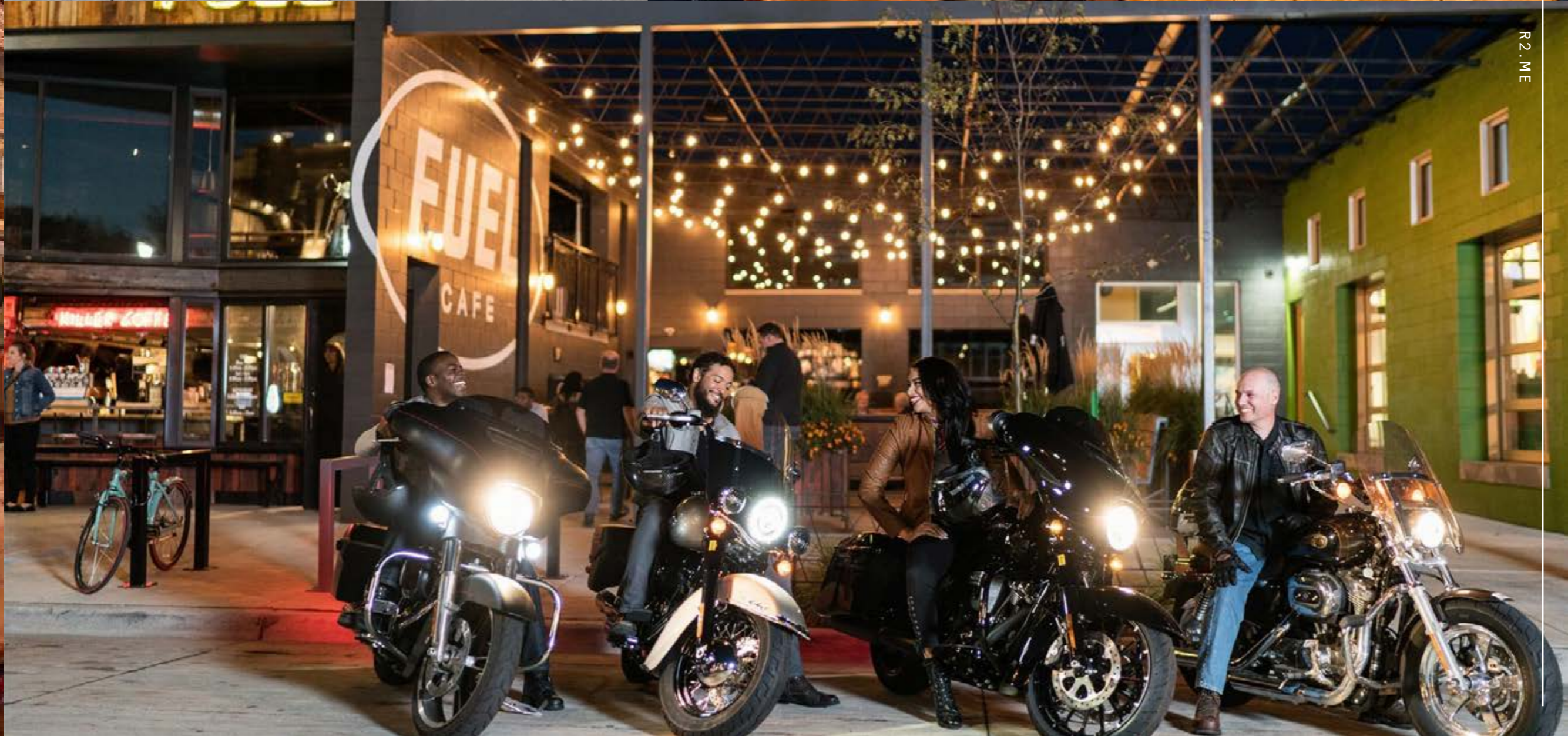
— WALKER'S POINT Location/Neighborhood