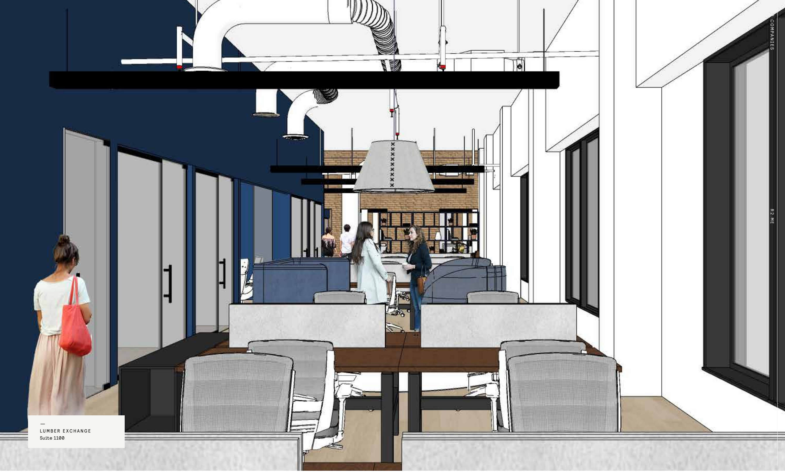
LUMBER EXCHANGE Suite 1100