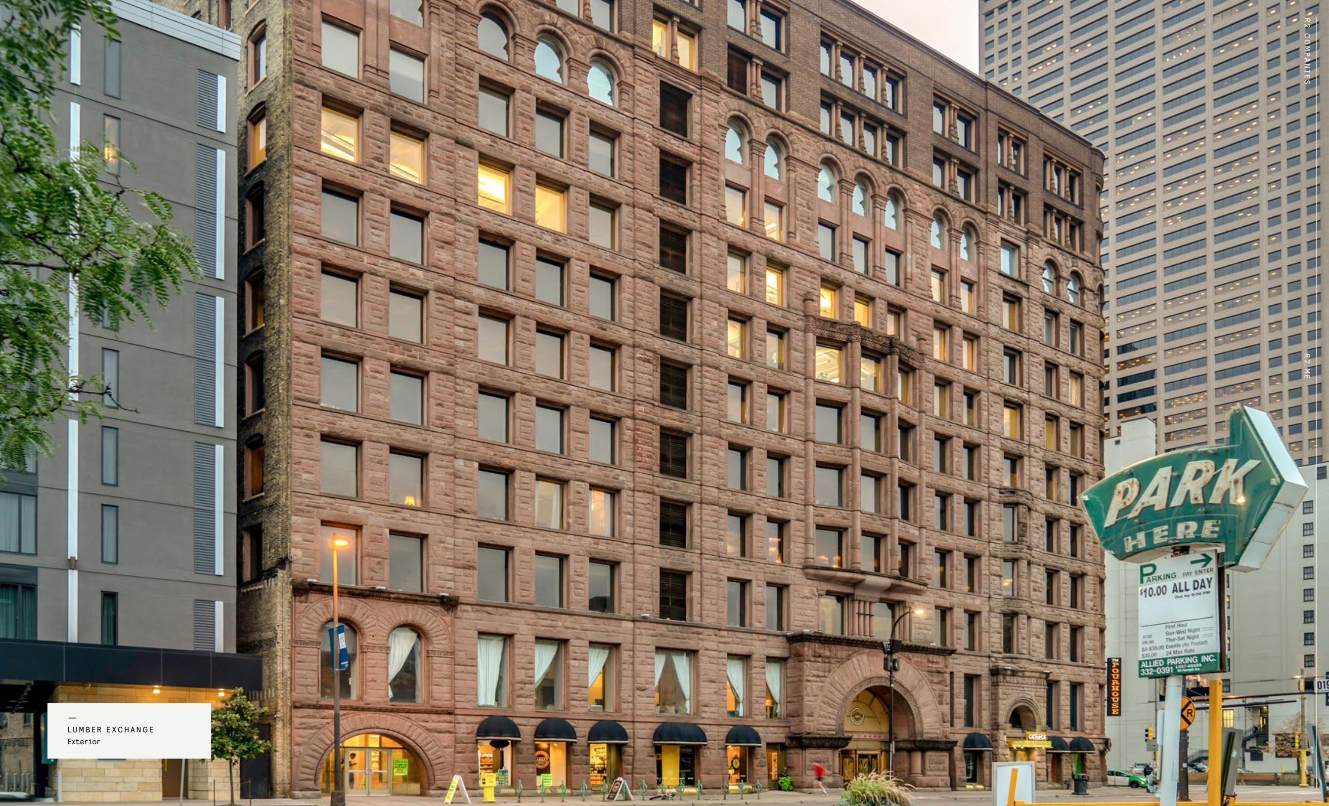
LUMBER EXCHANGE Exterior