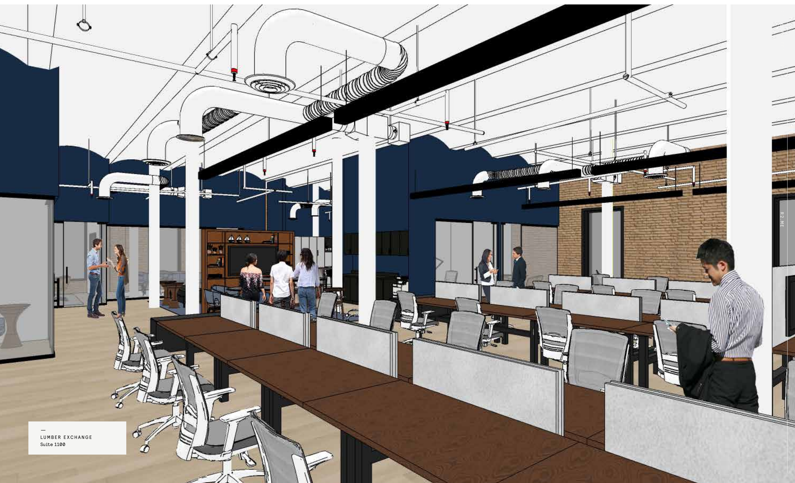
LUMBER EXCHANGE Suite 1100