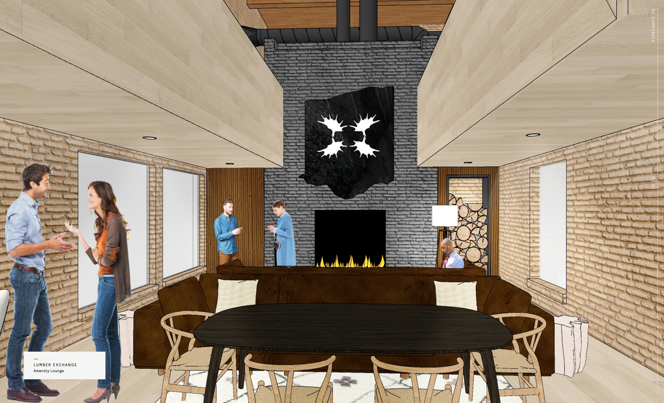
LUMBER EXCHANGE Amenity Lounge