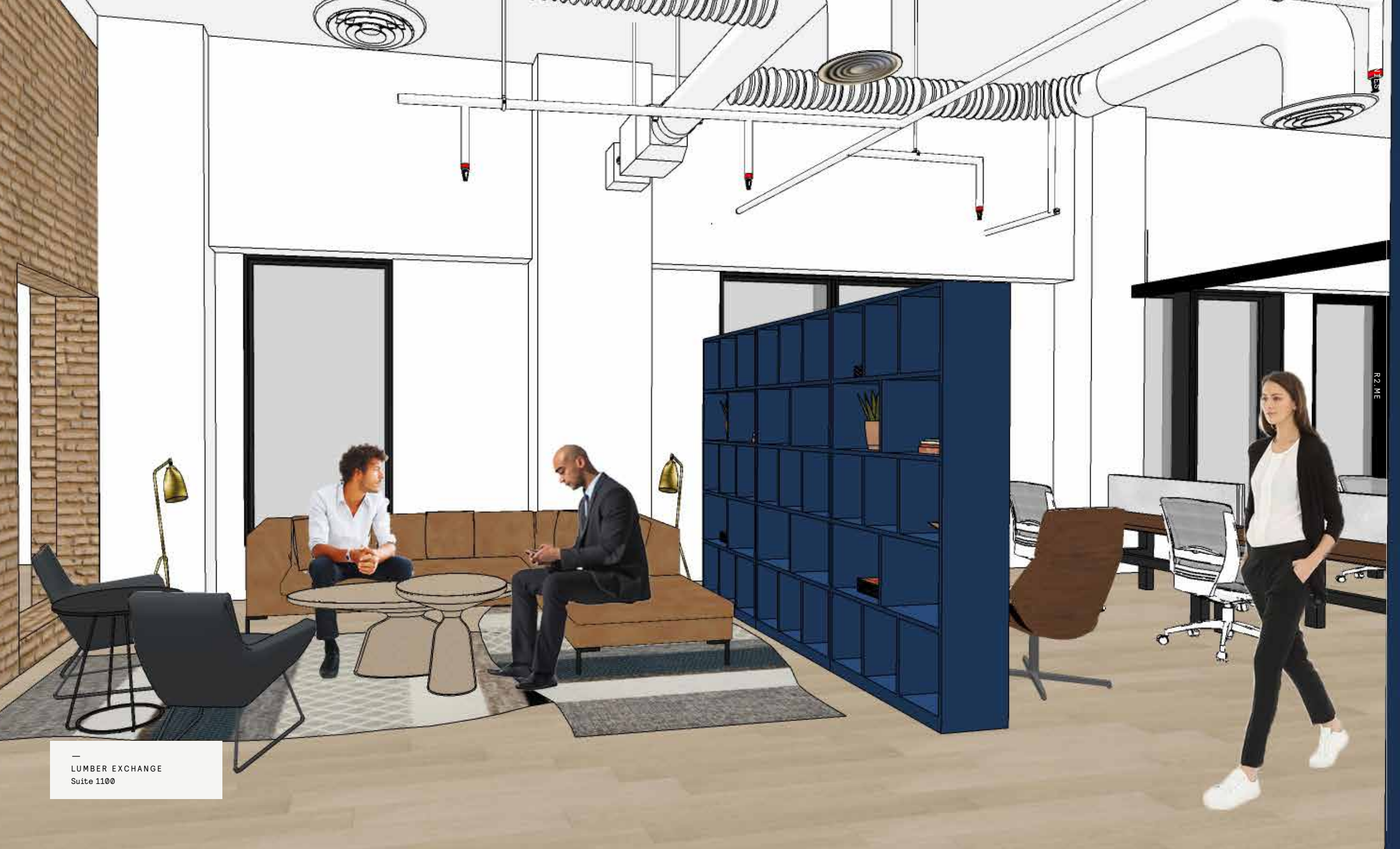
LUMBER EXCHANGE Suite 1100