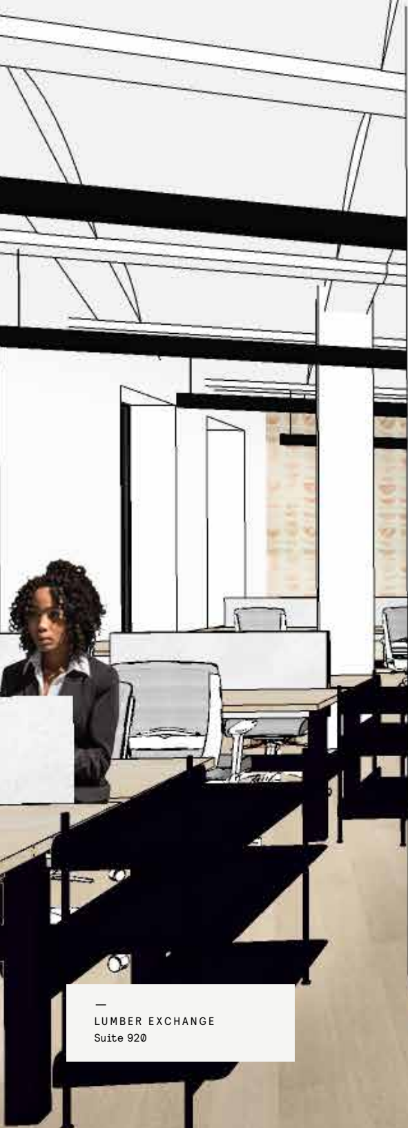
LUMBER EXCHANGE Suite 920