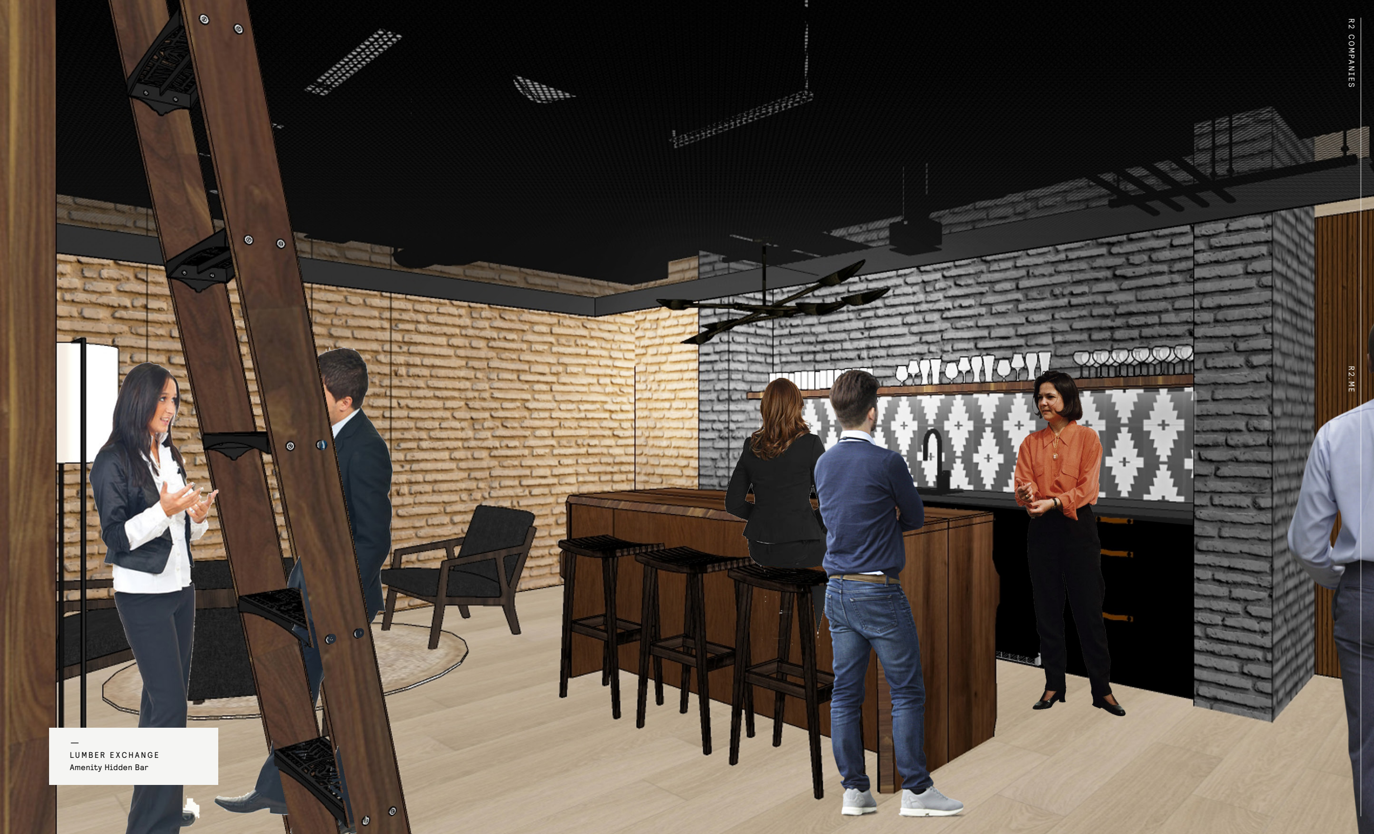
LUMBER EXCHANGE Amenity Hidden Bar