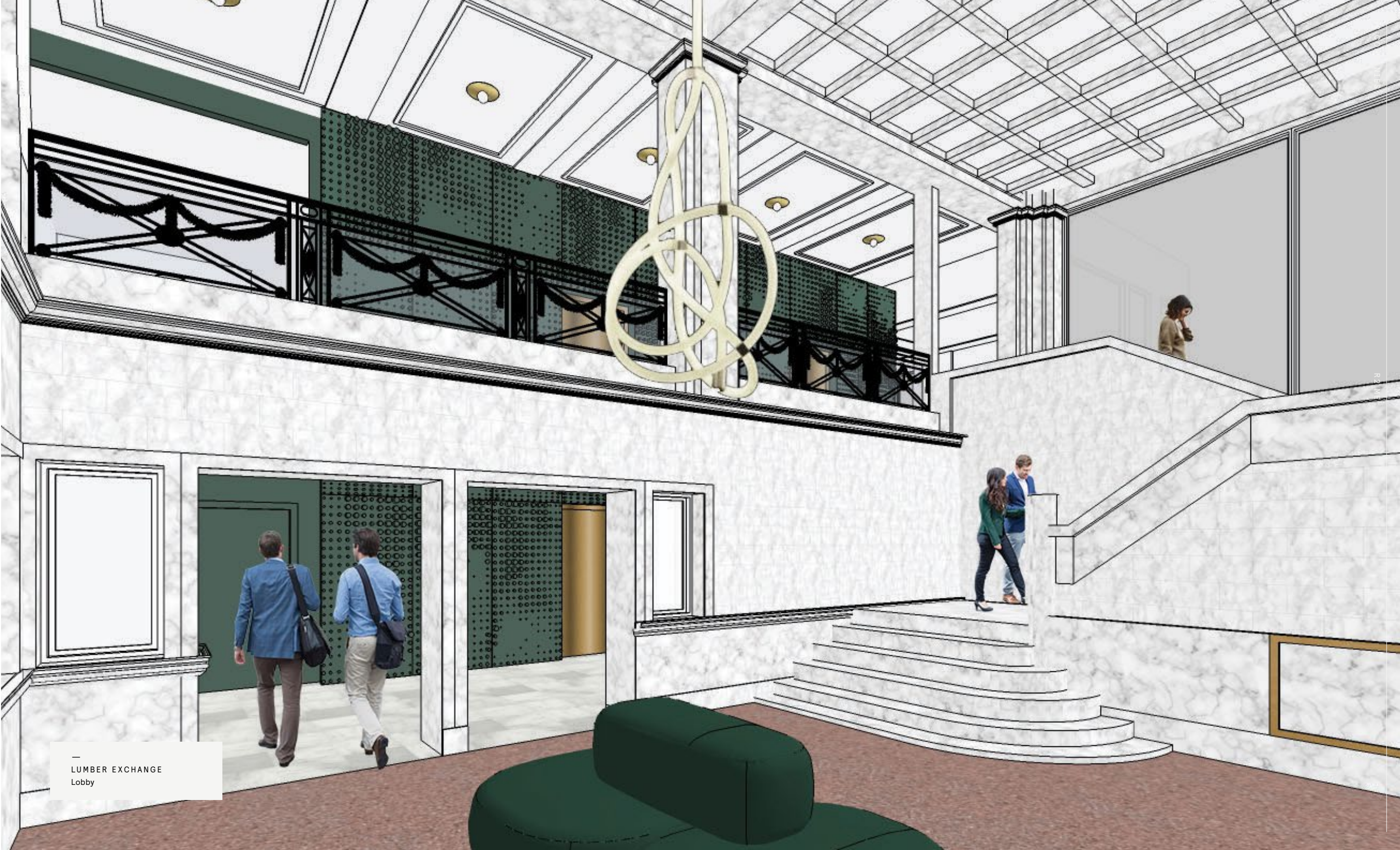
LUMBER EXCHANGE Lobby