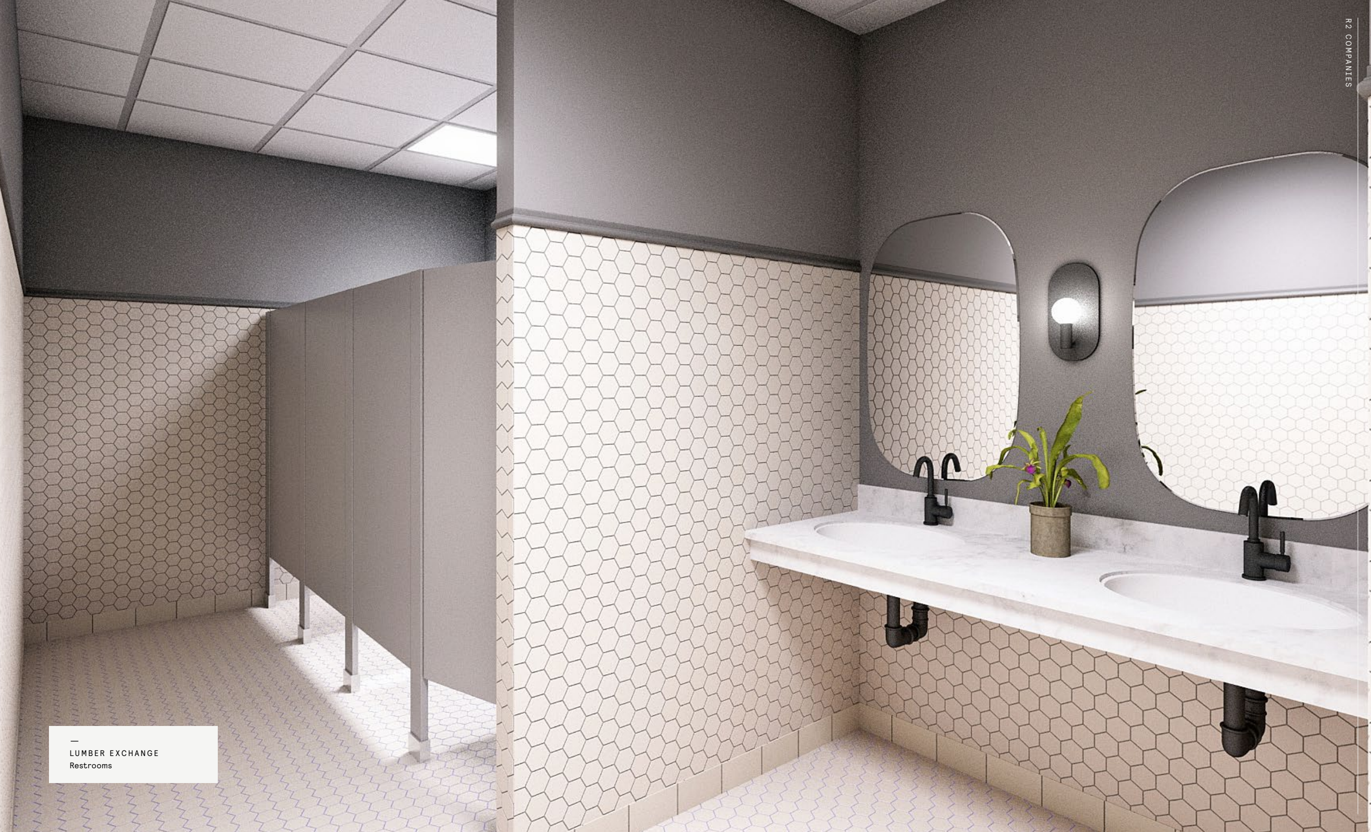
— LUMBER EXCHANGE Restrooms